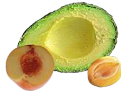
Fruit without stones