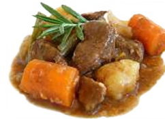
Stew (when cool)