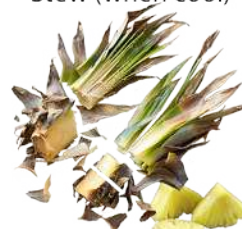
Pineapple heads (cut)