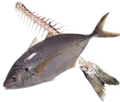
Fish and bone