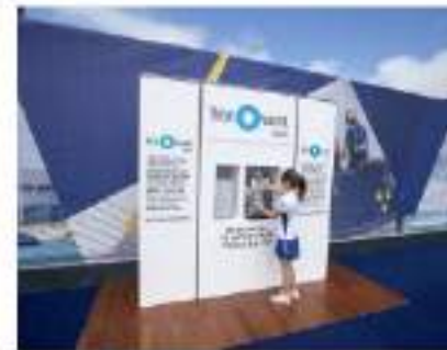
Americas Cup, Bermuda