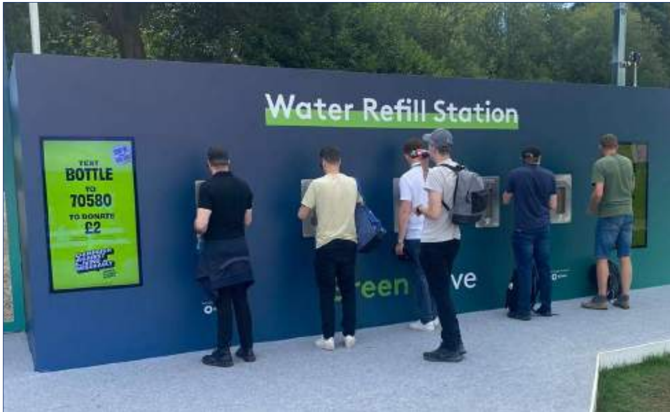
7-metre Bluewater Wall of Water™ installed for the 2022 BMW PGA Championship at Wentworth Club, Surrey, England.