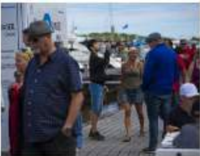
Sandhamn Island, Sweden