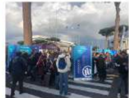
Formula E, 2018 Tour