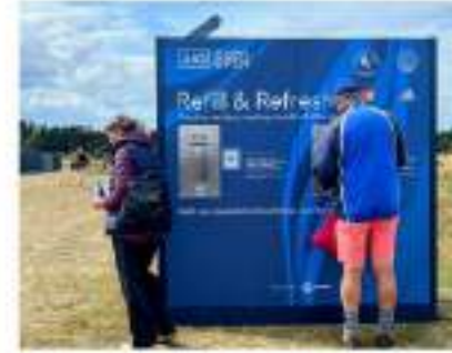
2022 AIG Women's Open, Muirfield