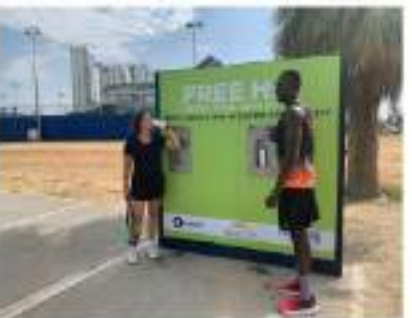
Zayed Sports City, UAE