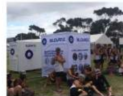
Rocking the Daisies Festival, South Africa