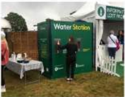
The Senior Open 2022, Glenisglies