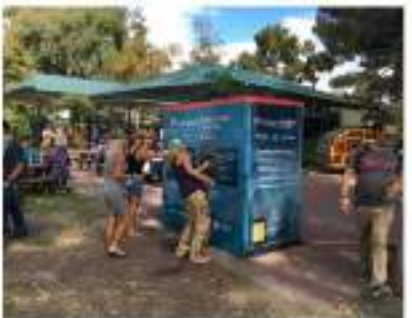
Ohana Music Festival, California