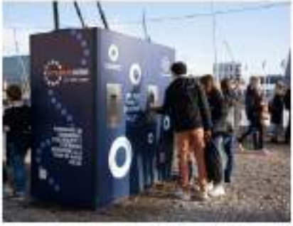
Transat Jacques Vabre 2019