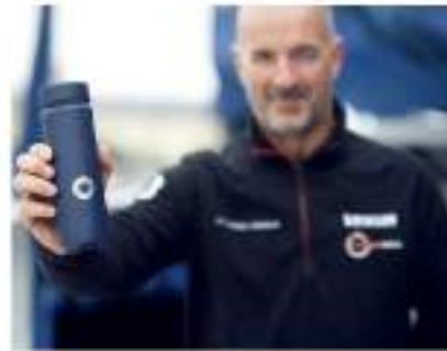
11th Hour Racing