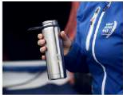
The Volvo Ocean Race, 2018 Tour