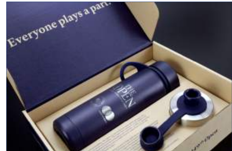
VIP Bluewater refillable bottle gift pack produced for players at The 149 th Open at Royal St George's, Kent, England.