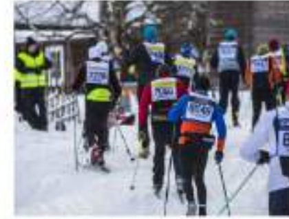
Vasaloppet Ski Race, Sweden