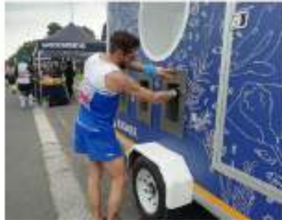
Cape Town Marathon