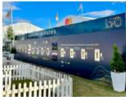
The 150 th Open, St Andrews

Some of the clients that we have provided sustainable hydration solutions for: