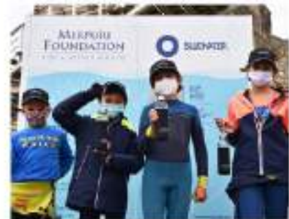
Mirpuri Foundation Sailing Academy, Portugal