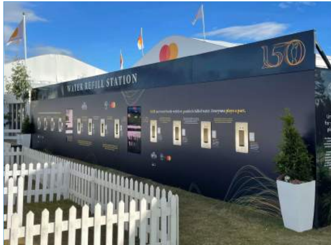
16-metre Bluewater Wall of Water™ installed for The 150 th Open at St Andrews, Scotland.