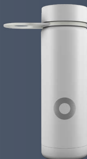
WHITE 400 ml/14oz