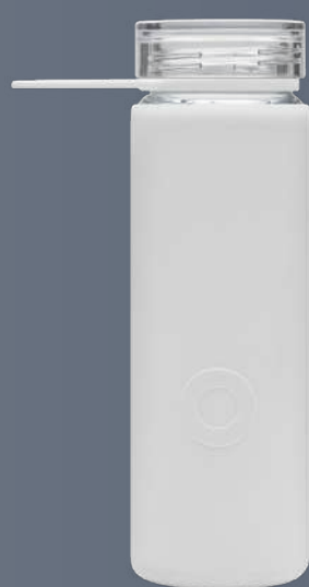
WHITE 500 ml/17 oz