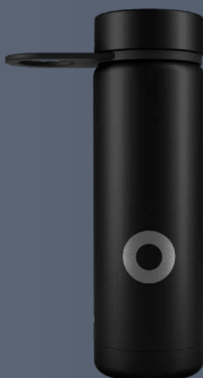
BLACK 400 ml/14oz

The Stainless Steel bottle is the modern solution designed to last a lifetime. Crafted to be the only bottle you will ever need, it consists of a minimal design, practical features, and vacuum insulation to keep ideal temperatures for any situation.