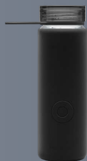
BLACK 500 ml/17 oz

Purposefully designed to promote transparency in the water you drink and eliminate the need for single-use plastic, this bottle combines aspects of simplicity, minimalism, and functionality, all to bring a comfortable and aesthetic solution to drinking water.