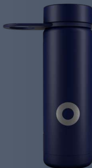
BLUE 400 ml/14oz