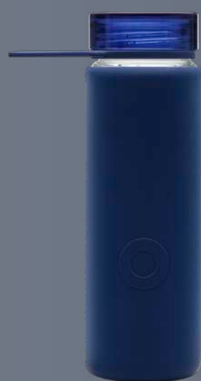
BLUE 500 ml/17 oz