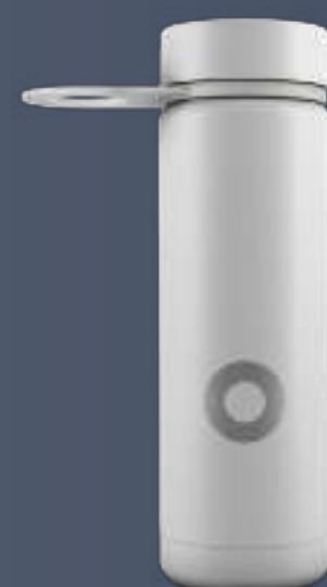
WHITE 400 ml/14oz