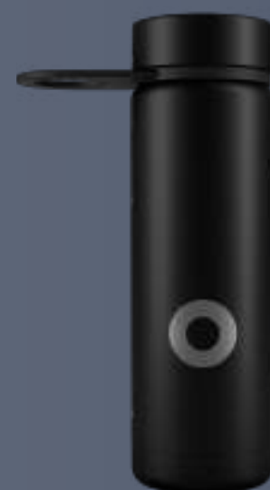
BLACK 400 ml/14oz

The Stainless Steel bottle is the modern solution designed to last a lifetime. Crafted to be the only bottle you will ever need, it consists of a minimal design, practical features, and vacuum insulation to keep ideal temperatures for any situation.