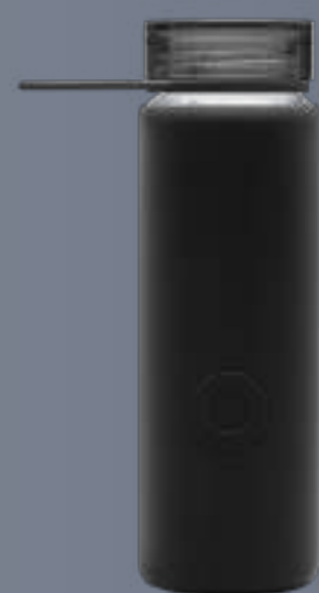
BLACK 500 ml/17 oz

Purposefully designed to promote transparency in the water you drink and eliminate the need for single-use plastic, this bottle combines aspects of simplicity, minimalism, and functionality, all to bring a comfortable and aesthetic solution to drinking water.