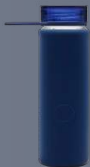
BLUE 500 ml/17 oz