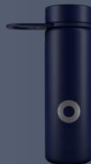
BLUE 400 ml/14oz